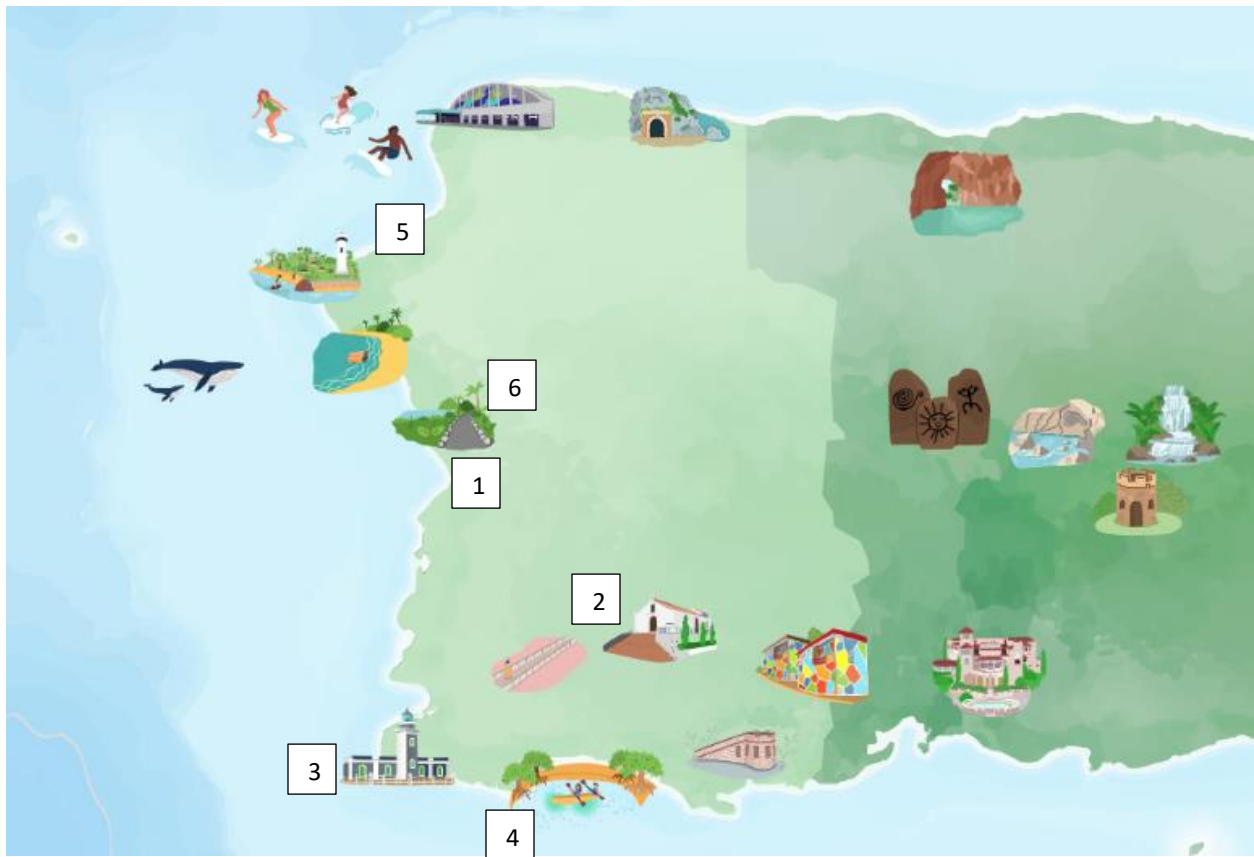
West coast of the main island

I've selected the most strategic points that combine the region's academic, historic, and natural value.